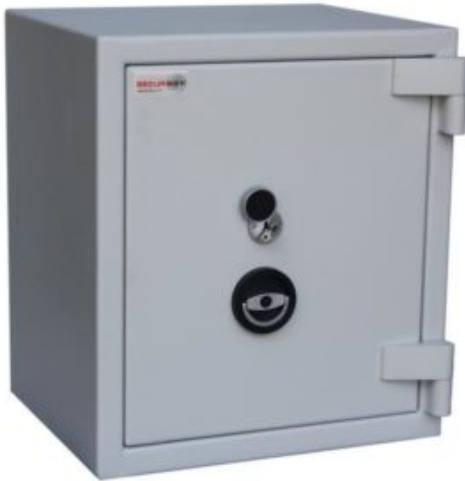
Euro Grade 3070