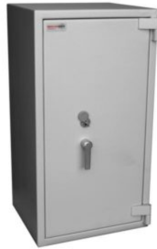
Euro Grade 2215