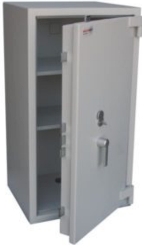
Euro Grade 2215