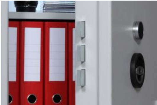
Euro Grade Square Boltwork