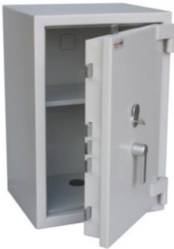
Euro Grade 2095