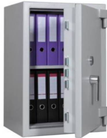
Euro Grade 2095