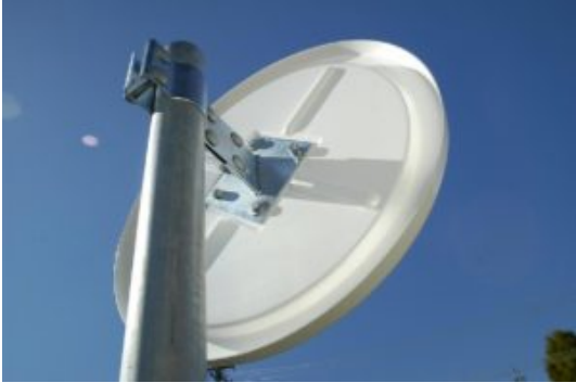
800mm Pro Series Traffic Mirror Fixing