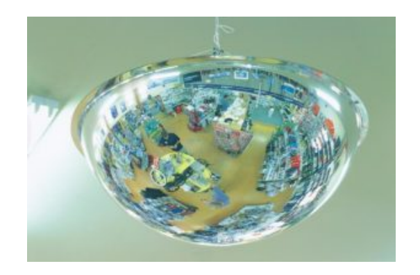
900mm Acrylic Ceiling Dome