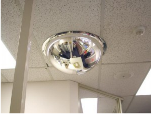
600mm Acrylic Ceiling Dome