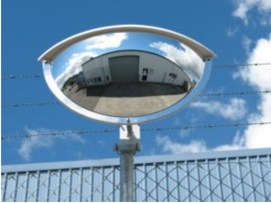
900 x 450mm Exterior Half Face Mirror