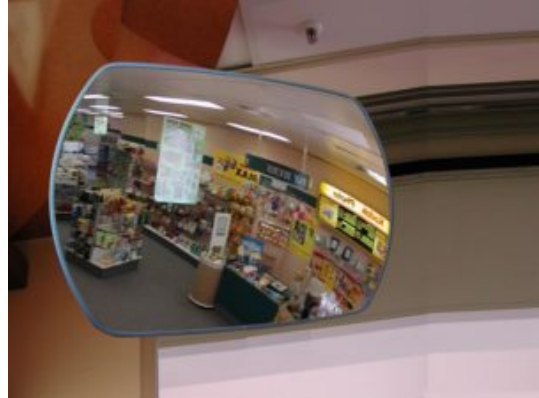
600x400mm Acrylic Interior Mirror