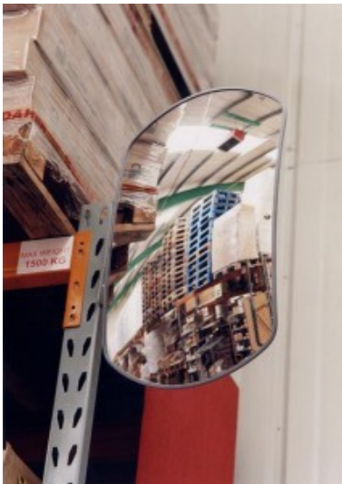
600x400mm Acrylic Interior Mirror