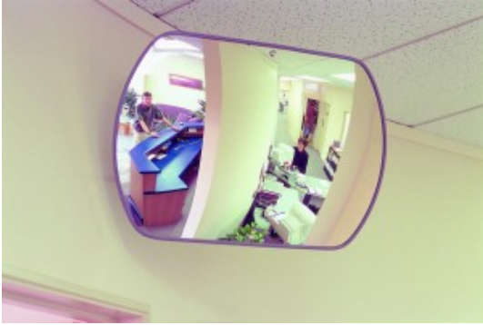
600x400mm Acrylic Interior Mirror