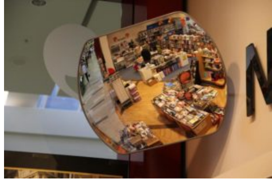
600x400mm Acrylic Interior Mirror