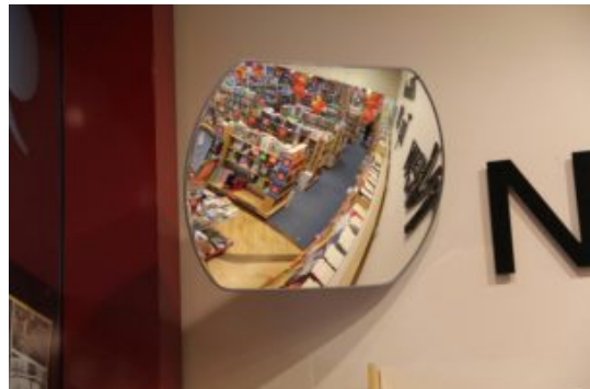
600x400mm Acrylic Interior Mirror