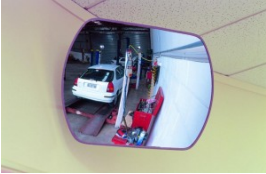
600x400mm Acrylic Interior Mirror