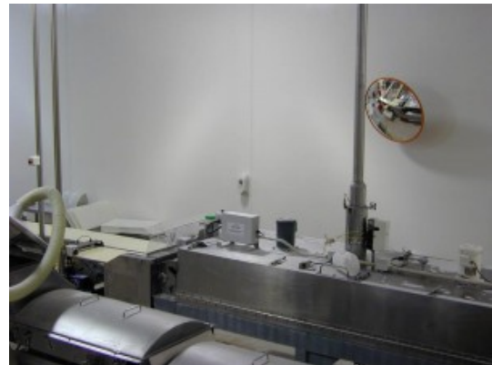
450mm Acrylic Food Processing Mirror