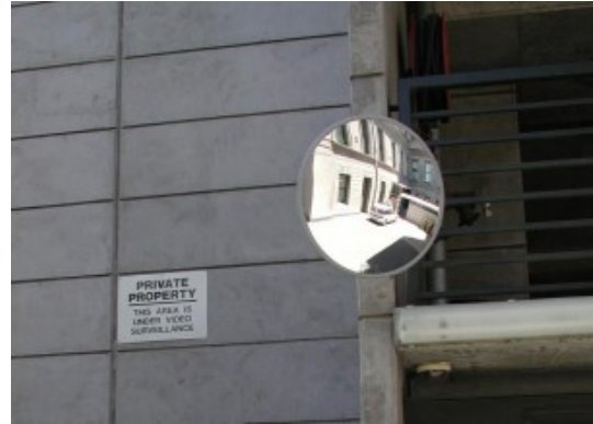
600mm Heavy Duty Exterior Mirror