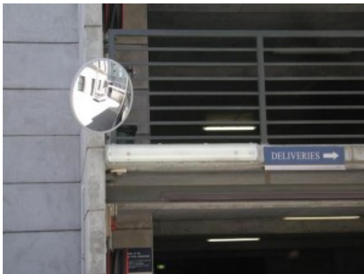
600mm Heavy Duty Exterior Mirror