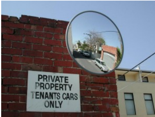
600mm Heavy Duty Exterior Mirror