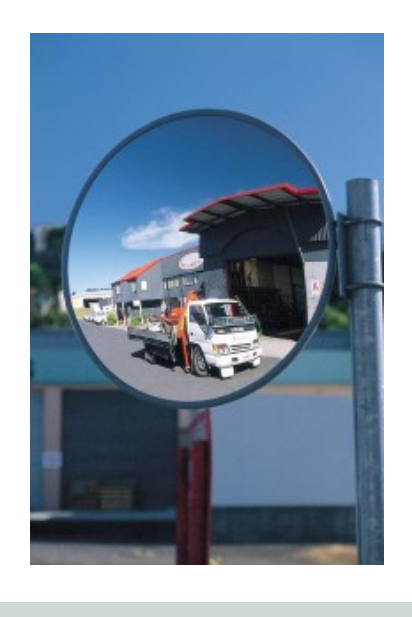
450mm Heavy Duty Exterior Mirror