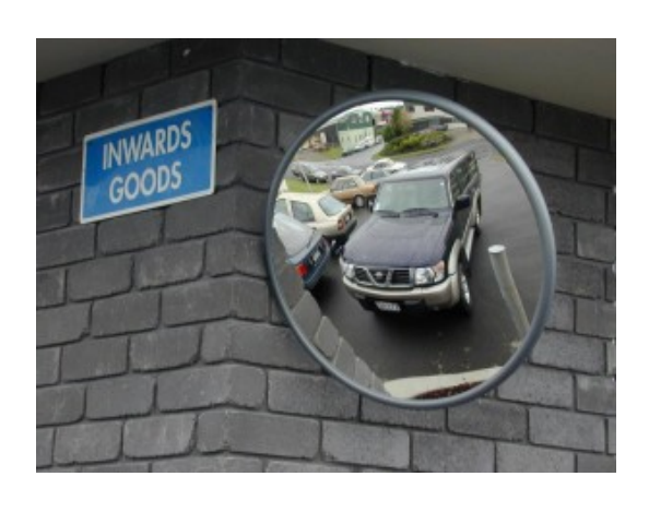
450mm Heavy Duty Exterior Mirror