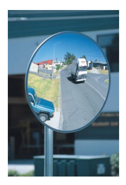
450mm Heavy Duty Exterior Mirror