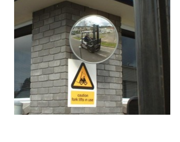
450mm Heavy Duty Exterior Mirror