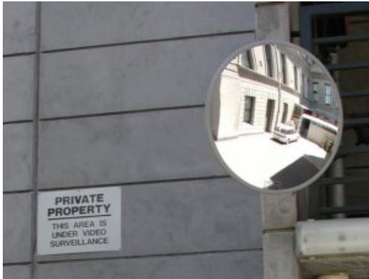
400mm Acrylic Interior/Exterior Mirror