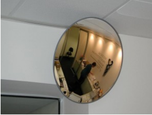
300mm Acrylic Interior Mirror