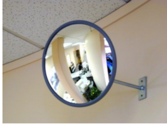
300mm Acrylic Interior Mirror