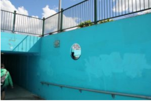
500mm Stainless Steel Wall Dome Mirror