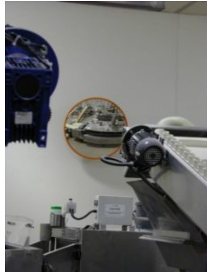
450mm Stainless Steel Food Processing Mirror