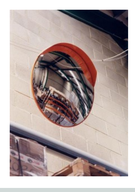
600mm Stainless Steel Anti-Vandal Mirror