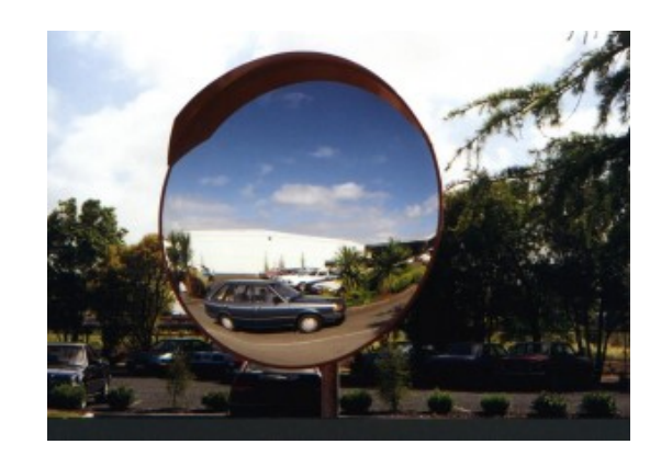
600mm Stainless Steel Anti-Vandal Mirror