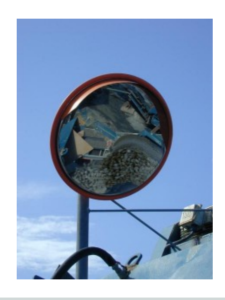
600mm Stainless Steel Anti-Vandal Mirror