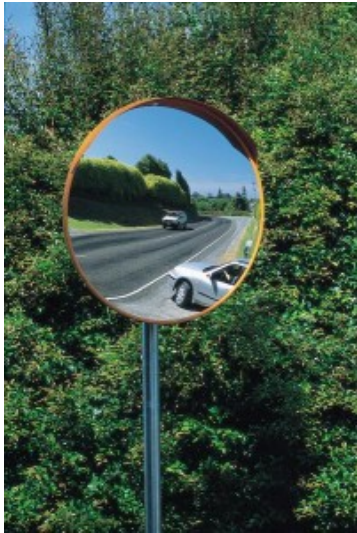
450mm Stainless Steel Anti-Vandal Mirror