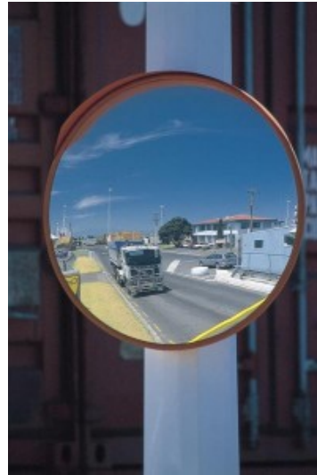
450mm Stainless Steel Anti-Vandal Mirror