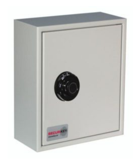
Deep Key Vault 48 Dial Combination Lock