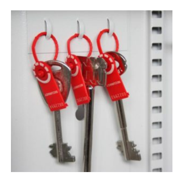
Security Seals & Loops