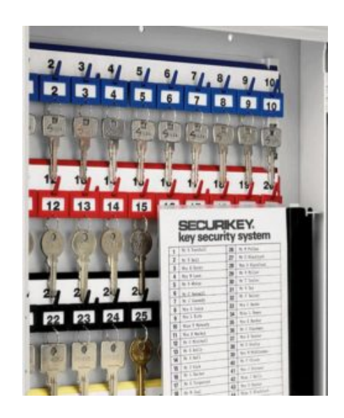
Key Vault Interior