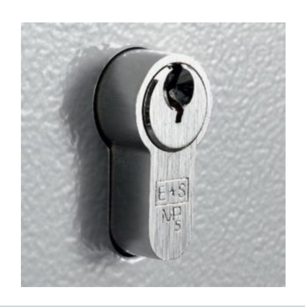
Euro Profile Cylinder