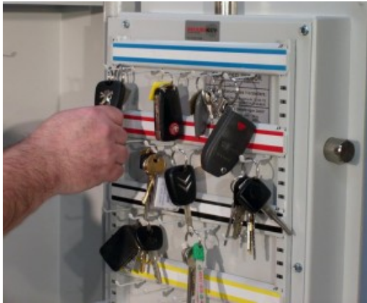
Deep High Security System 50 Keys