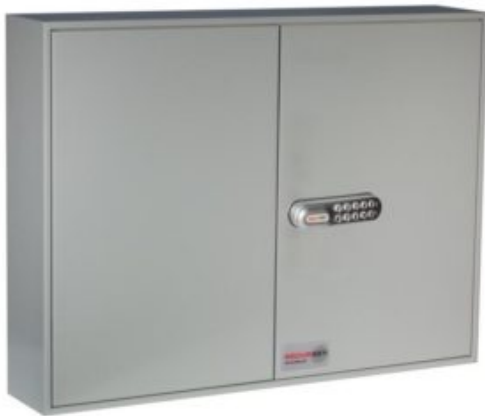
System 100 Padlock CL1000 Electronic Cam Lock