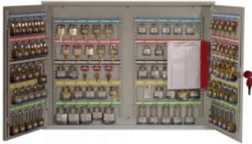
System 100 Padlock