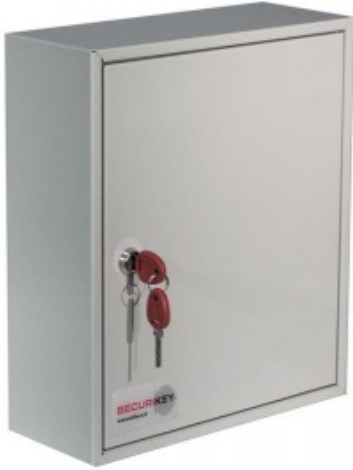
System 24 Padlock