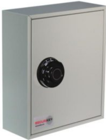
System 24 Padlock Dial Combination Lock