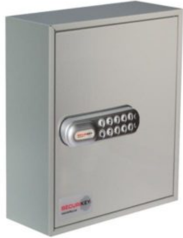
System 24 Padlock CL1000 Electronic Cam Lock