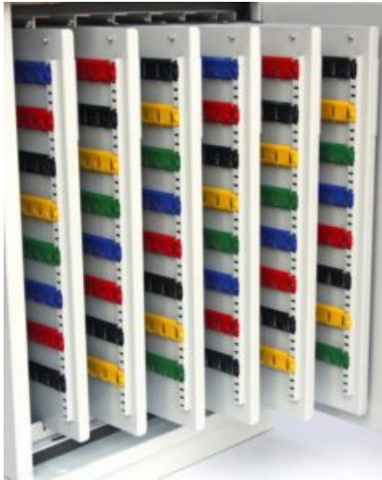
Floor Standing System Telescopic Panels