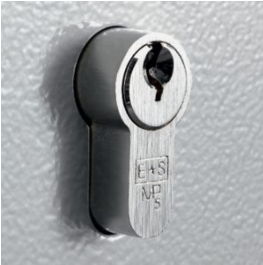
Euro Profile Cylinder