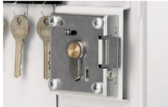
Euro Profile Cylinder Deadlock