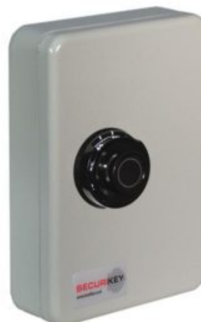
System 30 Dial Combination Lock