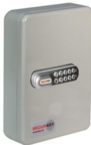
System 30 CL1000 Electronic Cam Lock