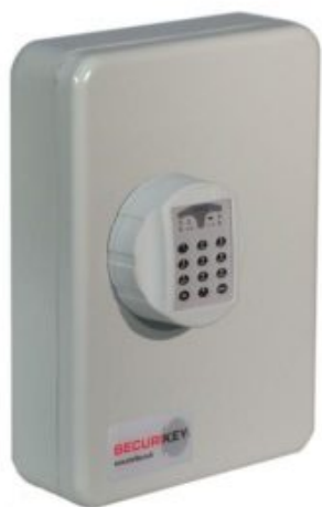
System 30 Electronic Lock REVO A