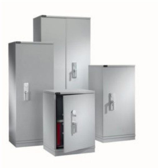
Fire Stor Group