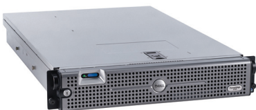
Dell PowerEdge 2950

The Dell PowerEdge 2950 server is equipped with a Baseboard Management Controller (BMC) that includes a complete set of tools that monitors server hardware, alerts you when server faults occur and enables basic remote operations. For environments with servers located in secure data centers or in sites with no IT staff, Dell offers an optional feature for PowerEdge servers, the Dell Remote Access Controller (DRAC). Operated through a Web-based graphic user interface, DRAC can enable remote access, monitoring, troubleshooting, repair and upgrades independent of the operating system status. Common software with the same family of PowerEdge 9th generation servers further helps simplify management. Plus, the Dell Behavioral Specification means one familiar platform for less complex deployment, management and serviceability as well as lower Total Cost of Ownership (TCO) over multiple generations of PowerEdge servers.