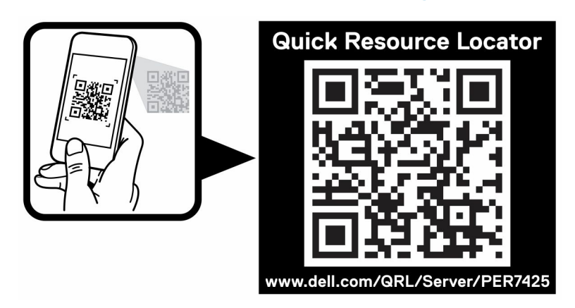
Figure 2. Quick Resource Locator for PowerEdge R7425 system