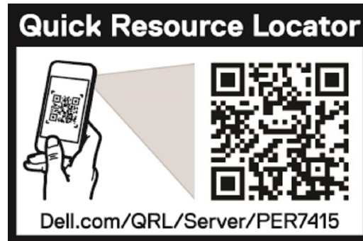
Figure 2. Quick Resource Locator for PowerEdge R7415