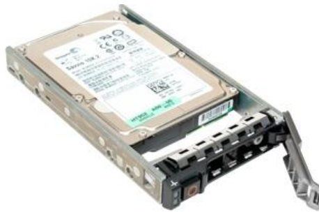
Figure 4. 2.5” Hard Drive Carrier

The PowerEdge M710HD supports the Dell 2.5” hard drive carrier. Legacy carriers are not supported on M710HD.