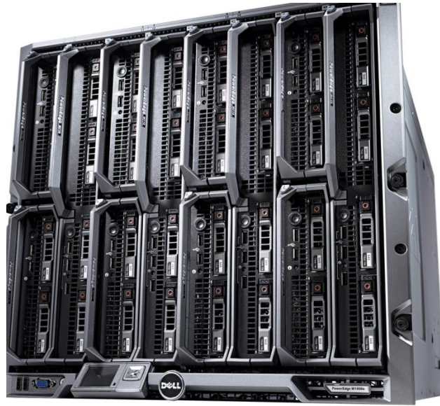
Figure 1. PowerEdge M1000e Blade Enclosure

The Dell™ PowerEdge™ M710HD is a half-height blade server that requires an M1000e chassis to operate.