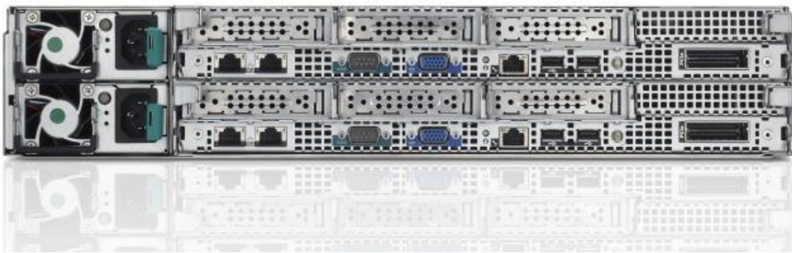
Figure 3. PowerEdge C6145 back view