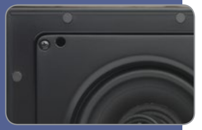
Magnetic grille attachment