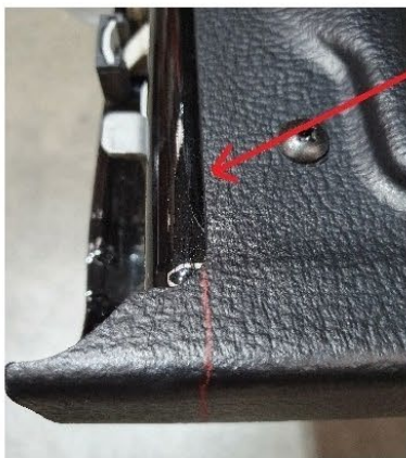
mark in line with finished edge

Close the tailgate and check your marking is straight and all the way around the edging of the Tailmate.