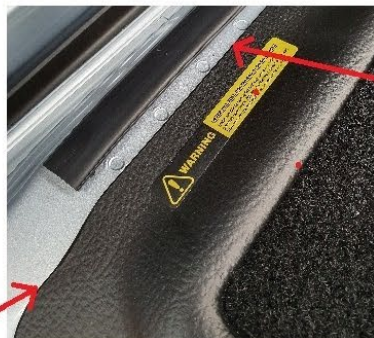
Re fit the Tailmate back in the rubber strip once you have finished trimming it.

In order to cut the edges on both sides you will need to remove the Tailmate.