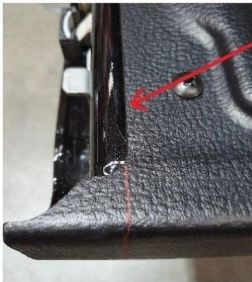
mark in line with finished edge

Start by marking the edge in which you will need to cut. Use the finishing end of the Tailmate as a guide on how much to cut as per below