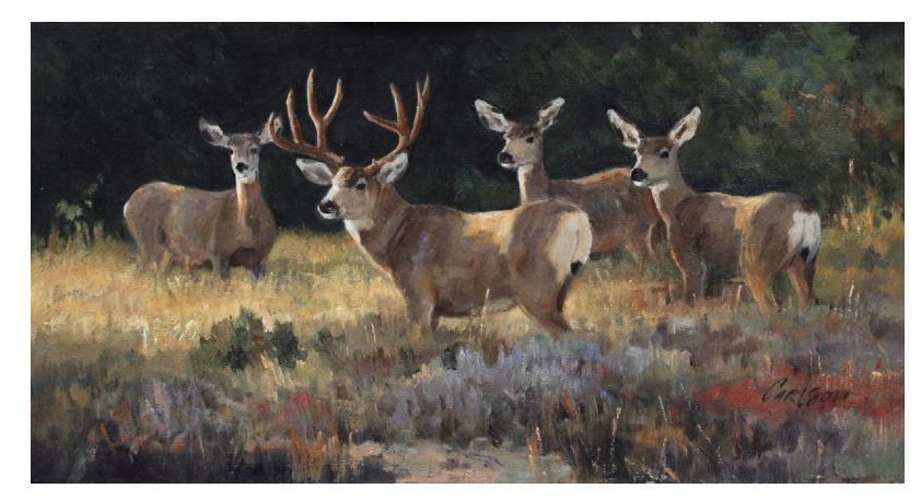
Ken Carlson, Mule Deer in Early Light, oil on board, 8 x 15 in, $7,800