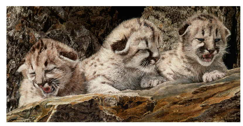
Bruce Lawes, The Cub Scouts, oil on linen, 8 x 16 in, $3,500