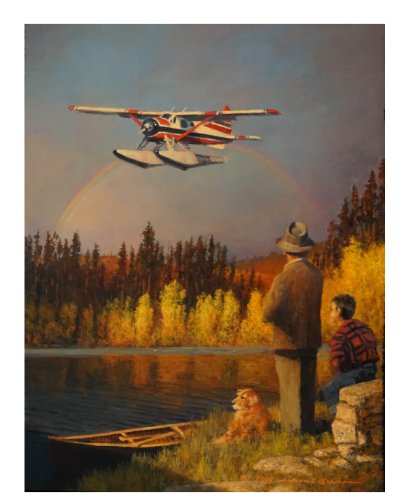
William Phillips, Golden Afternoon, oil on board, 12 \times 9 in, $3,500

130 E. BROADWAY | PO BOX 1149 | JACKSON, WYOMING 83001 JACKSON: (307) 733-3186 | SCOTTSDALE: (480) 945-7751 TRAILSIDEGALLERIES.COM | INFO@TRAILSIDEGALLERIES.COM