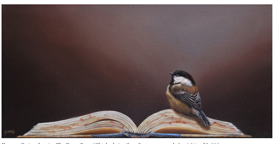
Jhenna Quinn Lewis, The Exact Page (Chickadee) , oil on linen mounted, 8 x 16 in, $3,600