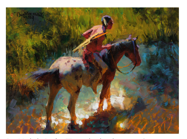
Dan Mieduch, Rippling Waters, oil on board, 9 x 12 in, $3,900