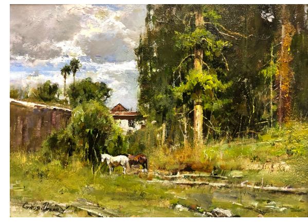
Cyrus Afsary, Companions, oil on canvas, 9 x 12 in, $4,000