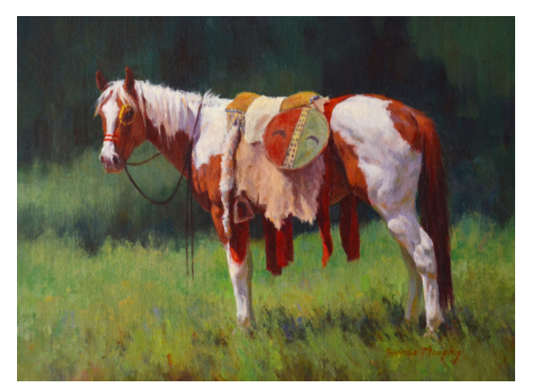
Brenda Murphy, Comanche Paint, oil on linen, 12 x 16 in, $3,800