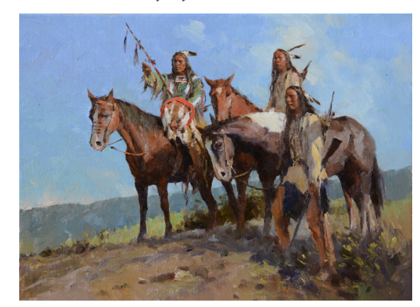
Z.S. Liang, Watching the Approaching Wagon Train, oil, 9 x 12 in, $5,000