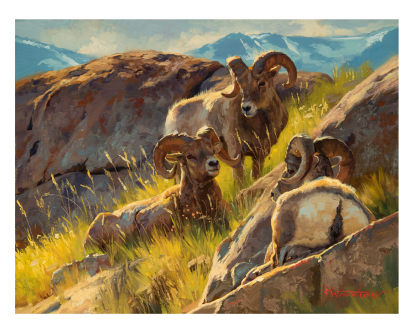
Dustin Van Wechel, Lazy Days, oil on linen, 11 x 14 in, $2,300