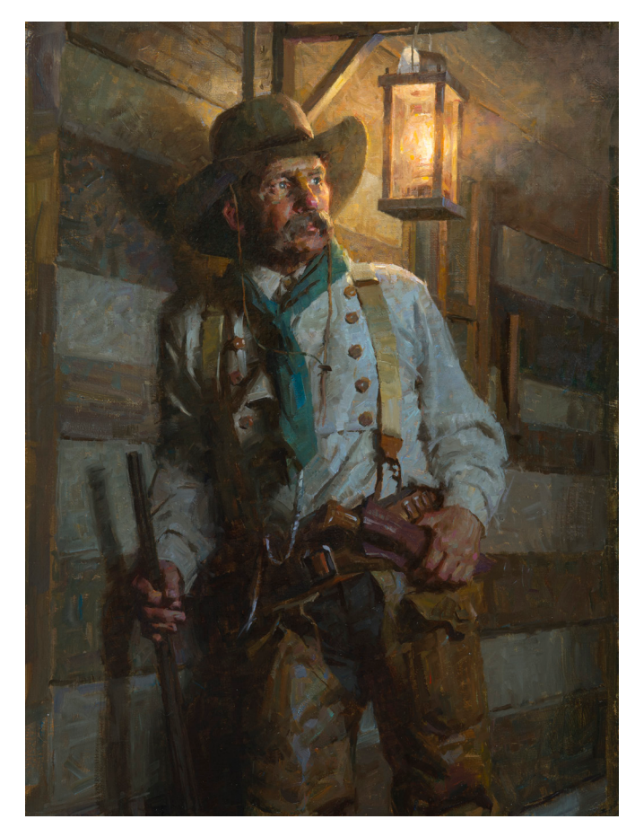
Morgan Weistling, The Ballad of Frank Maynard , oil on canvas, 16 \times 12 in, $8,500