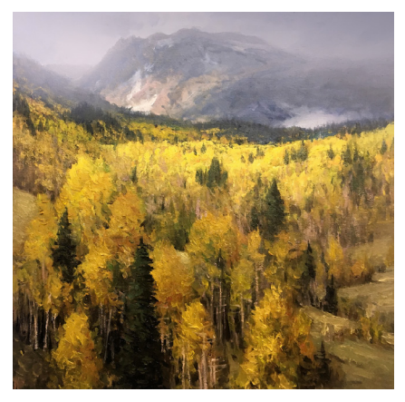
Michael Godfrey, A Valley of Aspen, oil, 8 x 8 in, $2,500