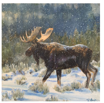
Sarah Woods, Snow Day, oil on board, 9 x 9 in, $1,000