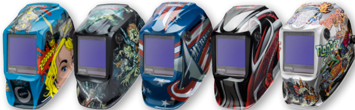
Jessi vs. The Robot™ K3372-4 Zombie™ K4158-4 3350 All American* K3175-4 Twisted Metal® K3248-4 Hot Rodders™ K4440-4