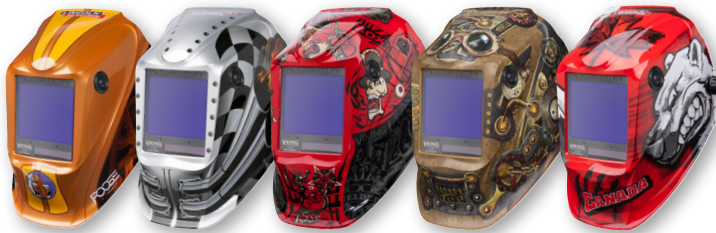
Terracuda* K3039-4 Motorhead* K3100-4 Mojo* K3101-4 Steampunk™ K3428-4 Polar Arc® K3255-4