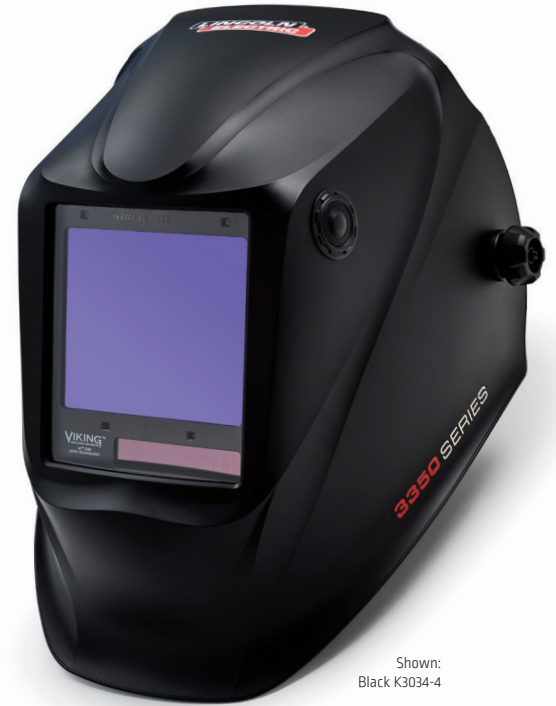
Shown: Black K3034-4