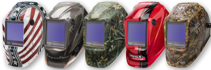
Daredevil™ K3683-4 Foose Imposter™ K4181-4 White Tail Camo™ K4412-4 Code Red® K4034-4 Born To Weld™ K3616-4