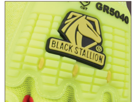
TPR pads protect back of hand and fingers