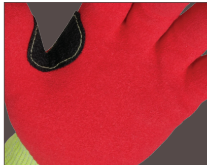
Sandy nitrile palm coating improves grip