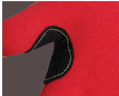
Thumb patch provides extra durability