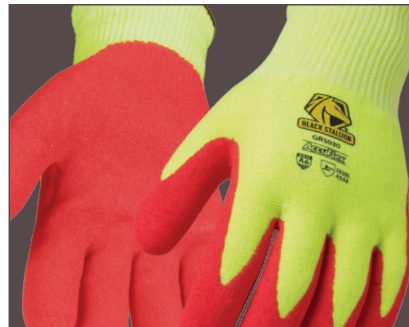
Hi-vis back & palm improves safety