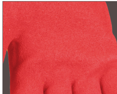
Sandy nitrile palm coating improves grip