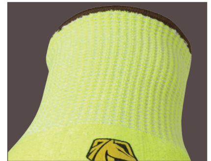
Seamless knit cuff for a comfortable fit