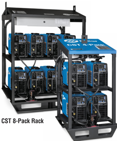
CST 8-Pack Rack