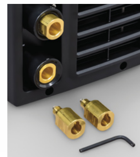
CST 282 with Tweco-style receptacles shown.

Universal connector system allows the machine to be quickly configured to either Tweco®- or Disne-style receptacles. Extra receptacles and wrench shown are sold separately as Universal Connector Kits (see page 4).