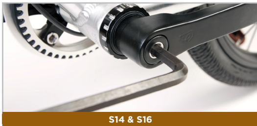
S14 & S16

Never ride your bike with loose cranks or pedals as this could damage your cranks which will never tighten up properly again.