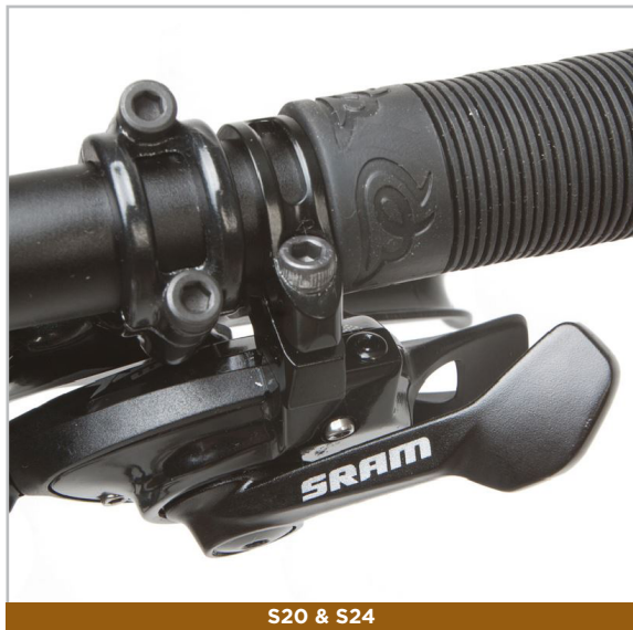
S20 & S24

Periodically check to make sure your gear hanger isn't bent. If it is, contact your Early Rider dealer or customer support.