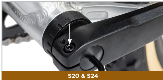
S20 & S24