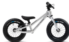
BIG FOOT 12