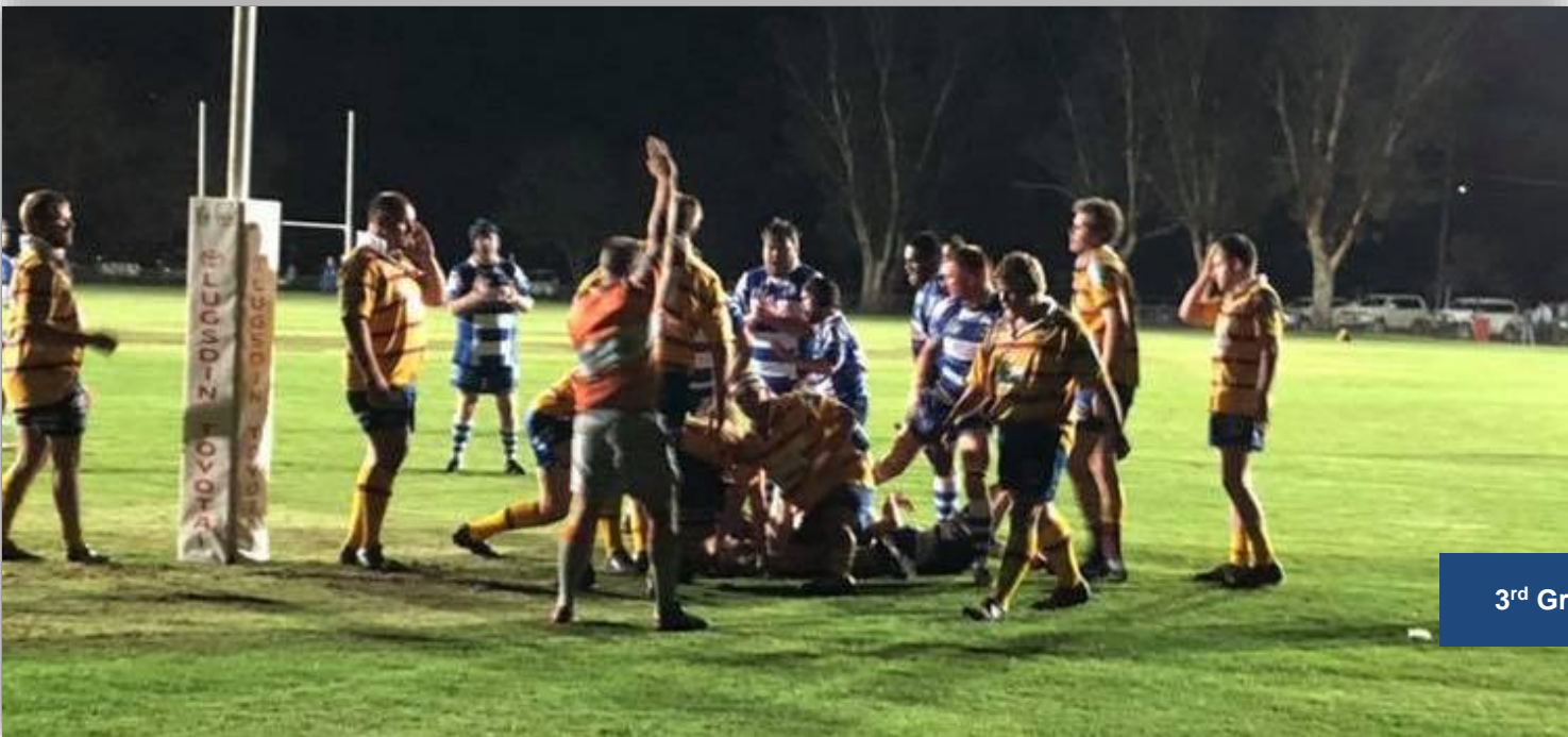
3 rd Grade - Try time @ Hay