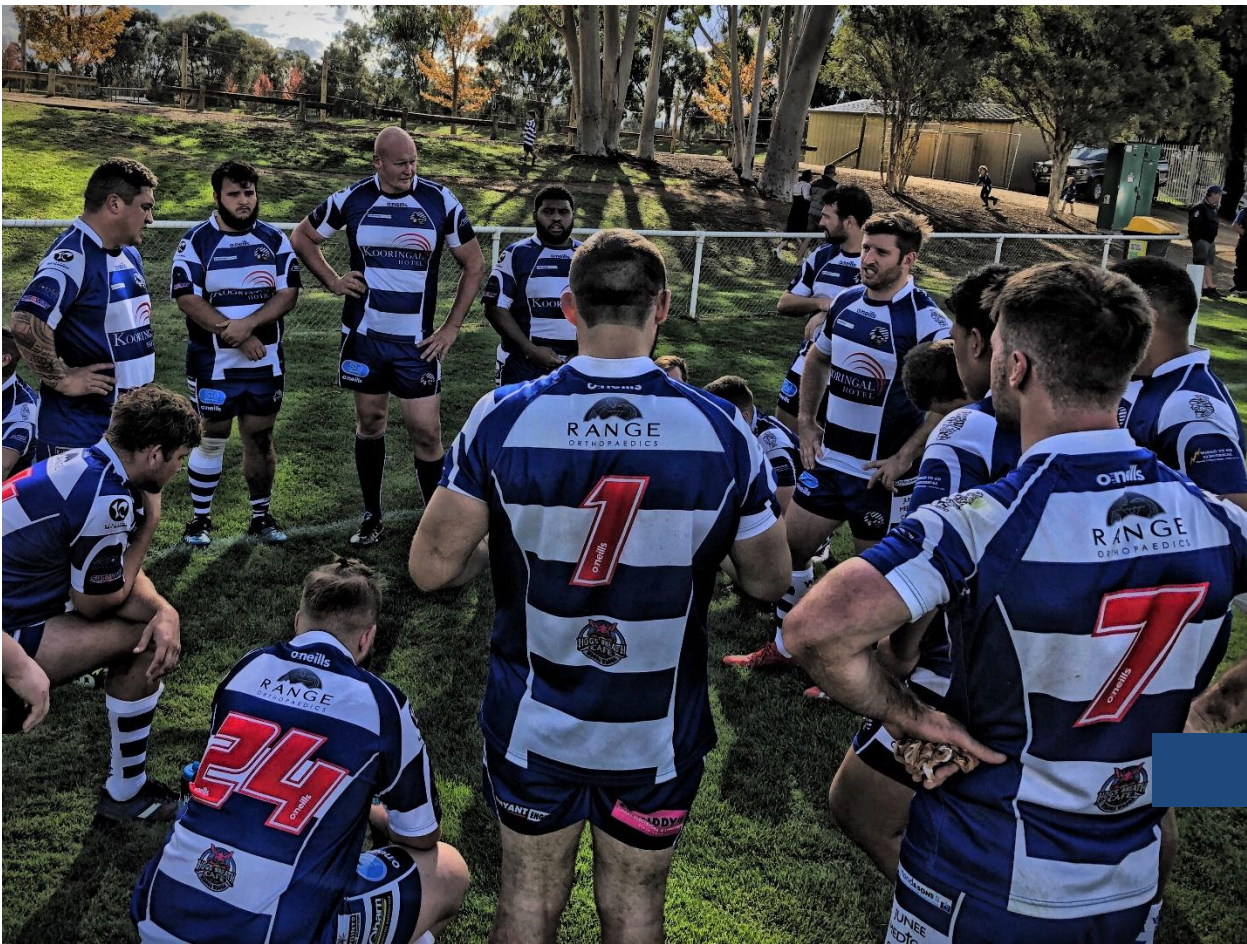
Half time City 1 st xv