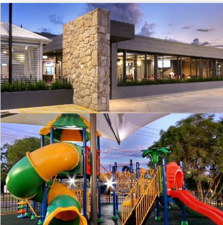
Koorungal Hotel sign on as Major Sponsor for the 2019 season.