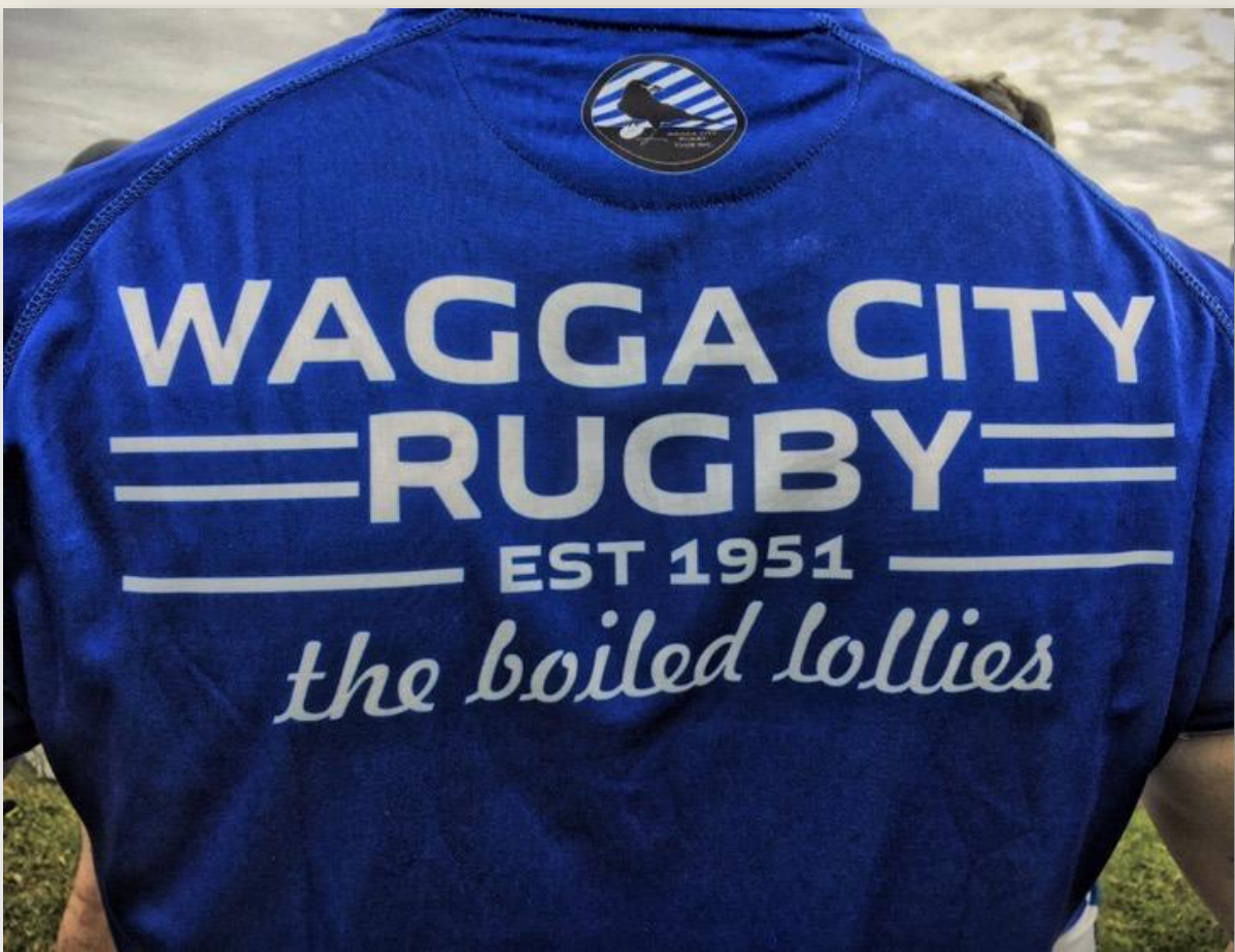
Wagga City Rugby – Jesus Loves The Boiled Lollies.