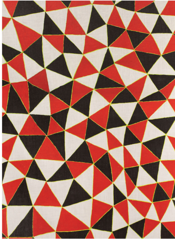
Triangles Red, Black and White

Pavy Art + Design Studio Our products are inspired by the visual vocabulary and iconic imagery of Francis X. Pavy, who designs and hand-paints every pattern and colorway in our collection. Like his paintings, all of our fabric and wallcoverings maintain the painterly texture and overlays of color. Due to our hand-made process, pattern variations occur.