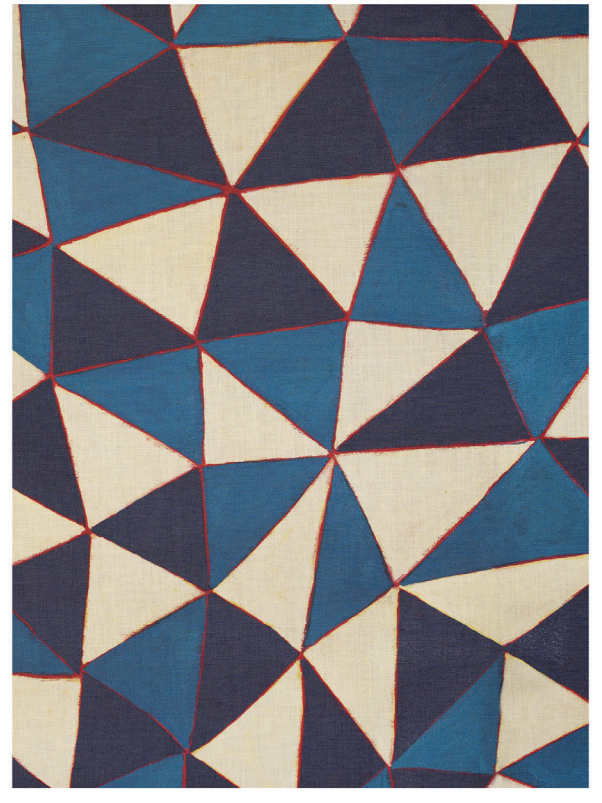
Triangles Turquoise, Indigo & Blonde

Pavy Art + Design Studio Our products are inspired by the visual vocabulary and iconic imagery of Francis X. Pavy, who designs and hand-paints every pattern and colorway in our collection. Like his paintings, all of our fabric and wallcoverings maintain the painterly texture and overlays of color. Due to our hand-made process, pattern variations occur.