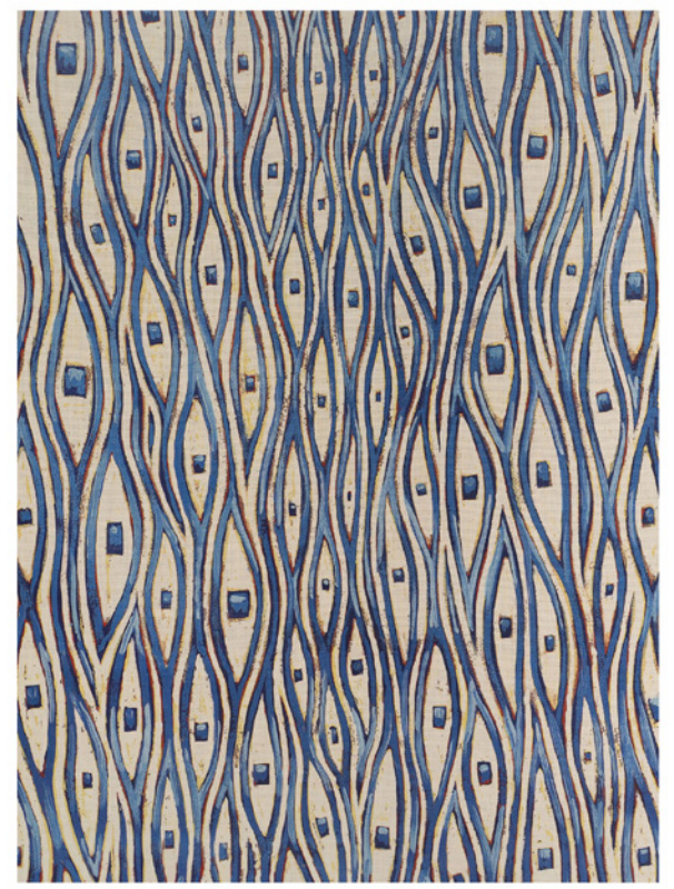
Tunica, Waterfall 100% Linen, Lightweight, Oyster