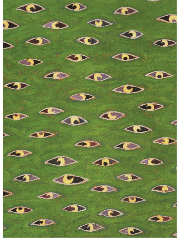
Moon Eyes, Green

Pavy Art + Design Studio Our products are inspired by the visual vocabulary and iconic imagery of Francis X. Pavy, who designs and hand-paints every pattern and colorway in our collection. Like his paintings, all of our fabric and wallcoverings maintain the painterly texture and overlays of color. Due to our hand-made process, pattern variations occur.