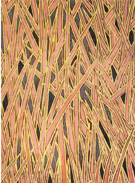
Canegrass at Dawn