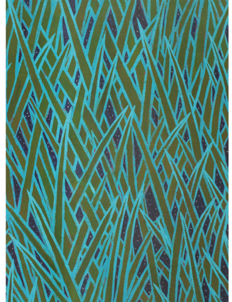
Canegrass at Midnight

Pavy Art + Design Studio Our products are inspired by the visual vocabulary and iconic imagery of Francis X. Pavy, who designs and hand-paints every pattern and colorway in our collection. Like his paintings, all of our fabric and wallcoverings maintain the painterly texture and overlays of color. Due to our hand-made process, pattern variations occur.