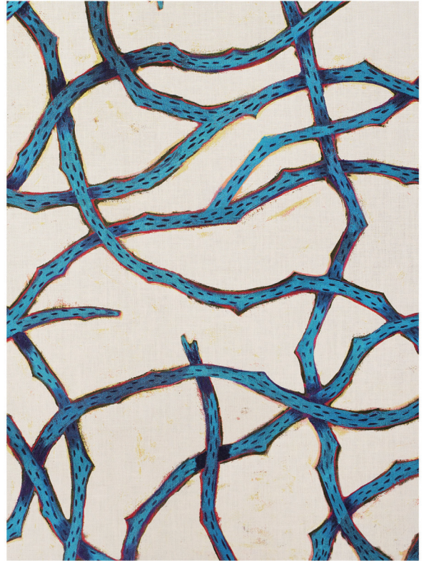
Briars Sapphire & Straw