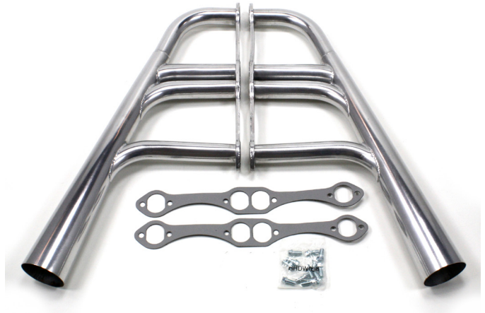
H8084 Traditional Lakester