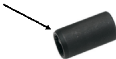
Fig-3 (Remove material, if air gap too small)

Remove material from outside bevel side of jackshaft coupler to meet required air gap of .075''-.125''