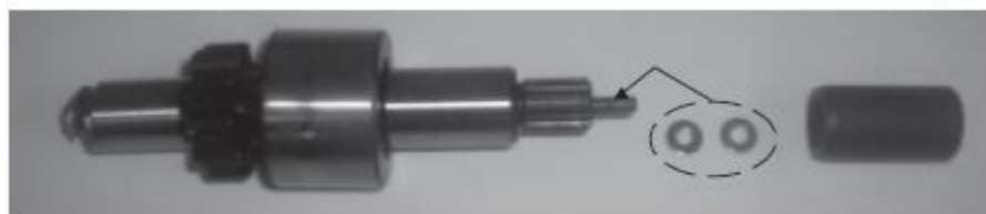
Fig-2 (If gap is too large, use shim inserts)

Remove material from outside bevel side of jackshaft coupler to meet required air gap of .075''-.125''