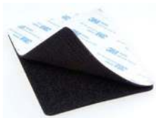
3M Velcro (default)